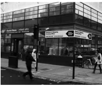
Cheviot House 227-233 Commercial Road London E1 2BU

Opening hours Monday to Friday: 9am—5pm (except the last Wednesday of every month: 10am—5pm) Saturday: 9am—1pm