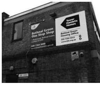
1 Rushmead Bethnal Green London E2 6NE

Opening hours Monday to Friday: 9am—5pm (except the last Wednesday of every month: 10am—5pm) Saturday: 9am—1pm