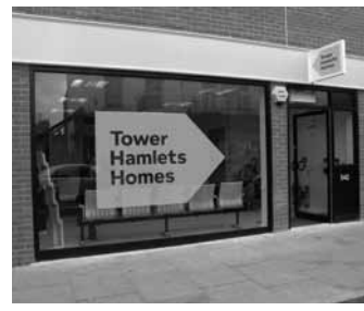
542 Roman Road London E3 5ES

Opening hours Monday to Friday: 9am—5pm (except the last Wednesday of every month: 10am—5pm) Saturday: 9am—1pm